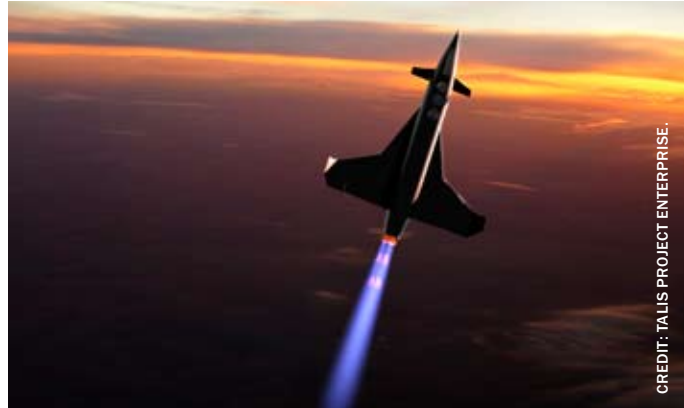
Talis Enterprise's BlackSky hopes to offer cheaper flights than its competitors.

This Swiss-German company hopes to begin testing its BlackSky prototype next year. The winged space plane will fly to a maximum altitude of about 46 kilometers (28.5 miles), somewhat lower than XCOR's Lynx vehicle.