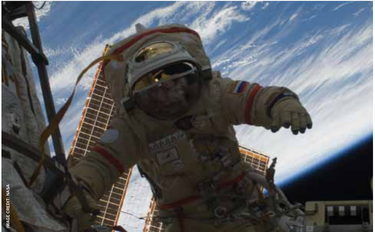
Russian cosmonauts Oleg Kotov and Maxim Suraev (out of frame), both Expedition 22 flight engineers, participate in a session of extravehicular activity (EVA) as maintenance and construction continue on the International Space Station. During the spacewalk, Kotov and Suraev prepared the Mini-Research Module 2 (MRM2), known as Poisk, for future Russian vehicle dockings.

Systems Inc., Space-DRUMS uses beams of sound energy to push materials away from the walls of a container in microgravity. The samples so produced will be ultra-pure and concentrated, and much larger than materials previously produced in space. A single sample might be worth hundreds of thousands of dollars.