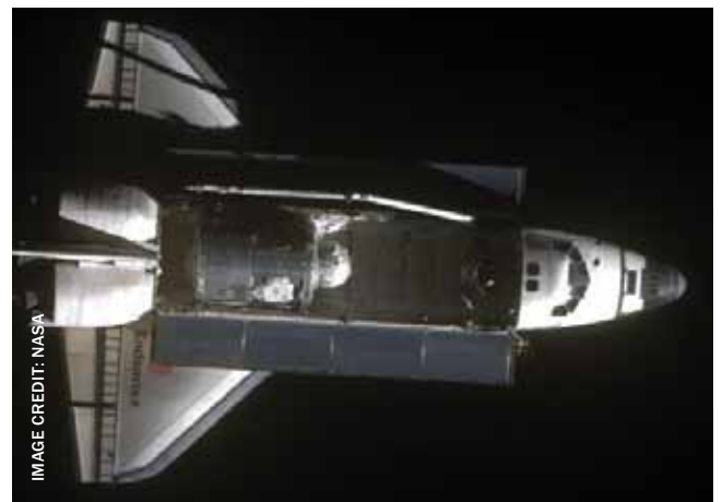
Backdropped by the blackness of space, Space Shuttle Endeavour was photographed by the Expedition 22 crew as the Shuttle approached the International Space Station during STS-130 rendezvous and docking operations on February 9, 2010. The Tranquility node can be seen in the Shuttle's payload bay.

As an Earth observation platform, ISS provides photos with resolution comparable to that of Earth resources satellites. Destiny has a special