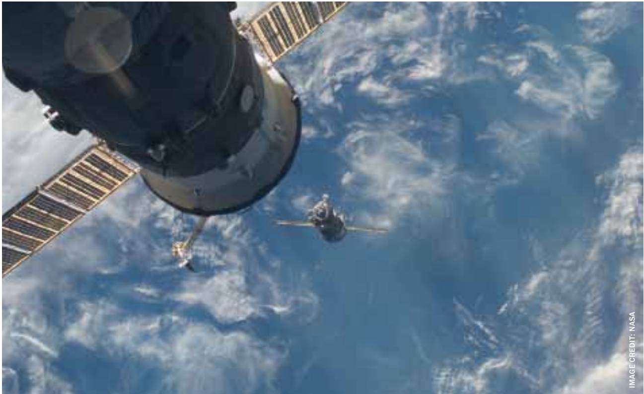
The Soyuz TMA-17 spacecraft approaches the International Space Station, carrying Russian cosmonaut Oleg Kotov, Soyuz commander and Expedition 22 flight engineer; along with NASA astronaut T.J. Creamer and Japan Aerospace Exploration Agency astronaut Soichi Noguchi, both flight engineers. Docking to the Zarya nadir port occurred at 4:48 p.m. (CST) on December 22, 2009. The trio launched aboard the Soyuz TMA-17 spacecraft at 3:52 p.m. on December 20 from the Baikonur Cosmodrome in Kazakhstan. A docked Russian spacecraft is at top left.

optical-quality window for photography, although the crew also takes pictures from the many other windows aboard. A noteworthy long-term project in this area is EarthKAM (Earth Knowledge Acquired by Middle School Students), which allows high school students to use a dedicated, remotely operated camera. The students' target requests are coordinated by college students at the University of California in San Diego, uplinked to a computer controlling the camera, and the resulting images are downlinked to the world wide web. As of 2006, more than 65,000 students in more than 1,000 schools in the U.S. and 12 other countries had used EarthKAM in geography and Earth science projects of their own formulation.